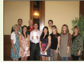
Recipients of the 2011 Ron Bate bursaries.

In addition to Ron Bate bursaries, Motor City accepted applications from younger students and awarded educational scholarships at the Sportsfest/Organ Donation High School Girls Baseball Tournament and the Essex Kent Junior Golf Tournament. Motor City encourages applicants to balance academics, sportsmanship, community involvement and giving back to those less fortunate. The youth of this community are the future of this community. Our enthusiasm for community and support of cooperatives is passed to them. We support their activities through sponsorships, mentorships and monetary donations. They are curious about the cooperative principles and want to learn more about benefits of banking with Motor City.