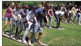
Having fun at CYL.